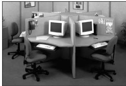
AXIS™: Workstation Clusters