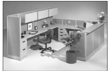
NAVA™: VQS ⇨ Quickship Panel-Based Systems Furniture