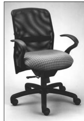
SEATING • FILING • ACCESSORIES

EFFECTIVE APRIL 2, 2008 PLEASE USE THESE 2001 COMBINED LIST PRICES PLUS 17%!