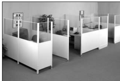
EFFICIENCY WALL™: Moveable Steel Partitions