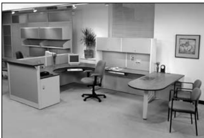
NAVA FS™: VQS ⇨ Quickship Freestanding Modular Furniture