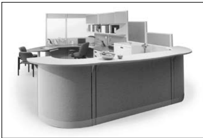
OFFICENTER™: Panel-Based and Floor-to-Ceiling Systems Furniture